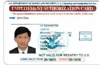
Employment Authorization Document "EAD"